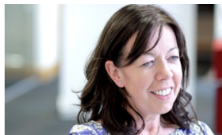
Meet the Programme Director and learn more at www.imi.ie