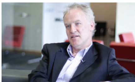
Meet the Programme Director and learn more at www.imi.ie