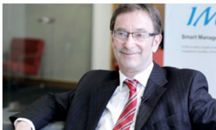
Meet the Programme Director and learn more at www.imi.ie