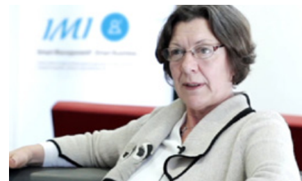
Meet the Programme Director and learn more at www.imi.ie