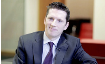
Meet the Programme Director and learn more at www.imi.ie